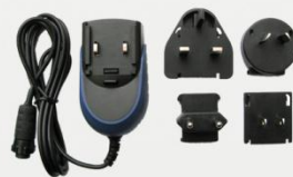
POWER SUPPLY WITH WORLDWIDE ADAPTERS