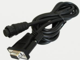
8' SERIAL CABLE