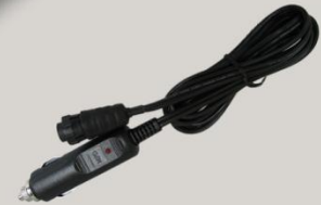
12V CAR POWER ADAPTER